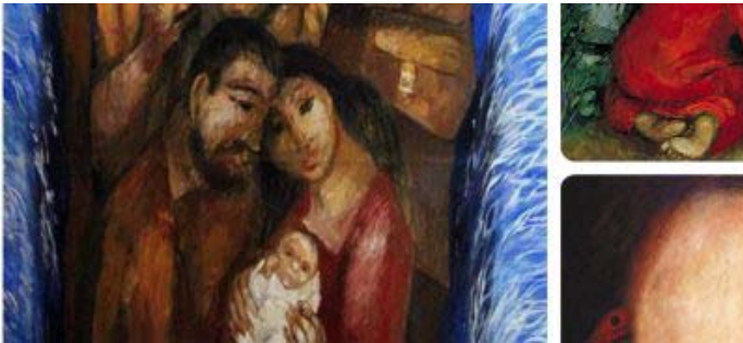
Everyone is welcome to this celebration at the Cathedral