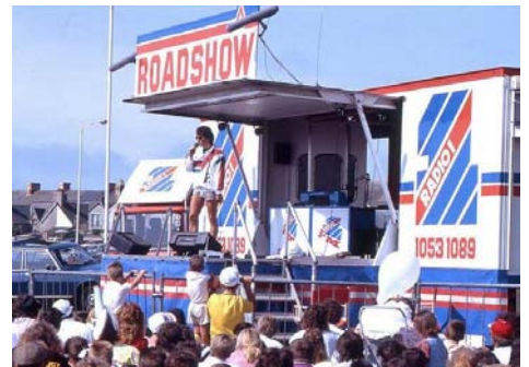
Actual roadshow may differ from that illustrated

These roadshows will be held in the following locations at 7.30pm: English Martyrs, Tuffley; Tuesday 25 April Alexander House, Bristol; Thursday 27 April (2.30pm and 7.30pm) St John the Baptist, Trowbridge; Thursday 11 May St George, Taunton; Tuesday 16 May St Joseph, Wroughton; Tuesday 23 May